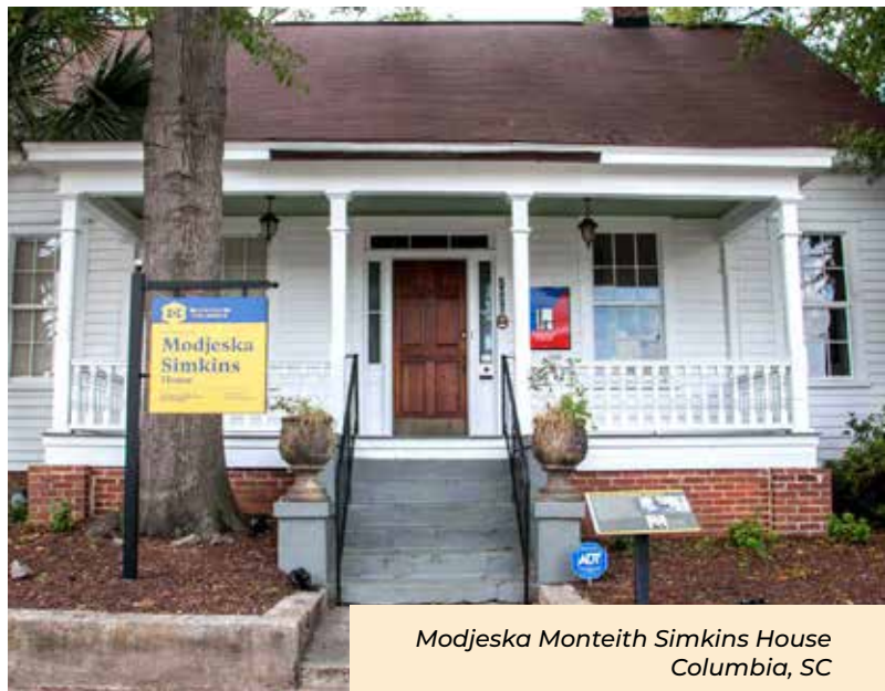
Modjeska Monteith Simkins House Columbia, SC

Continue your exploration of the U.S. Civil Rights Trail as you make your way southeast to the capital of South Carolina, Columbia. First stop on today's schedule is the Modjeska Monteith Simkins House.