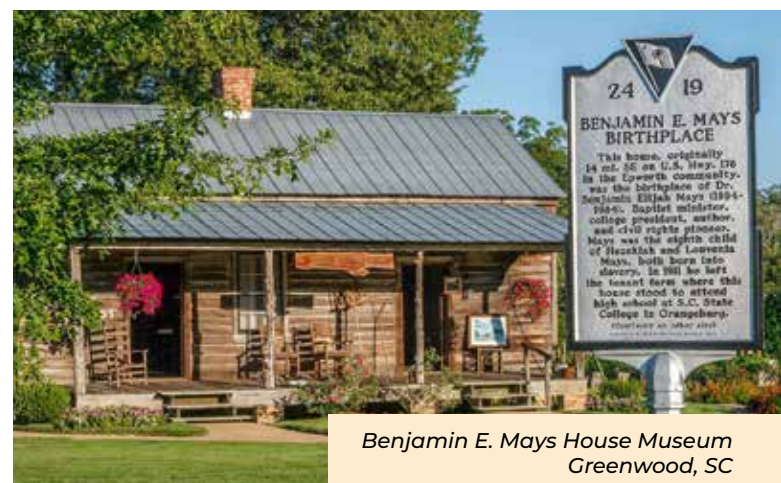
Benjamin E. Mays House Museum Greenwood, SC