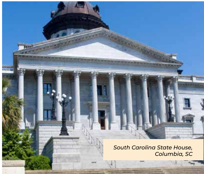
South Carolina State House, Columbia, SC

Guided tours of the State House and along Main Street where marches and protests took place are available through Columbia SC 63, a historic preservation organization at the University of South Carolina.