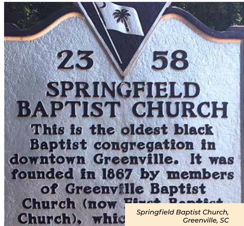
Springfield Baptist Church, Greenville, SC

Founded in 1867 by newly freed slaves, Springfield Baptist Church is the oldest historically Black Baptist church in Greenville and is still active in the community. In addition to being a center for spiritual growth, Springfield Baptist Church was headquarters for nonviolent civil rights protests in the 1960s. The church became pivotal in the movement on Jan. 1, 1960, with a peaceful march from the church to the Greenville Downtown Airport. The march was organized after the keynote speaker for a state NAACP convention, Jackie Robinson, the first Black Major League Baseball player, was denied use of the airport's waiting room.