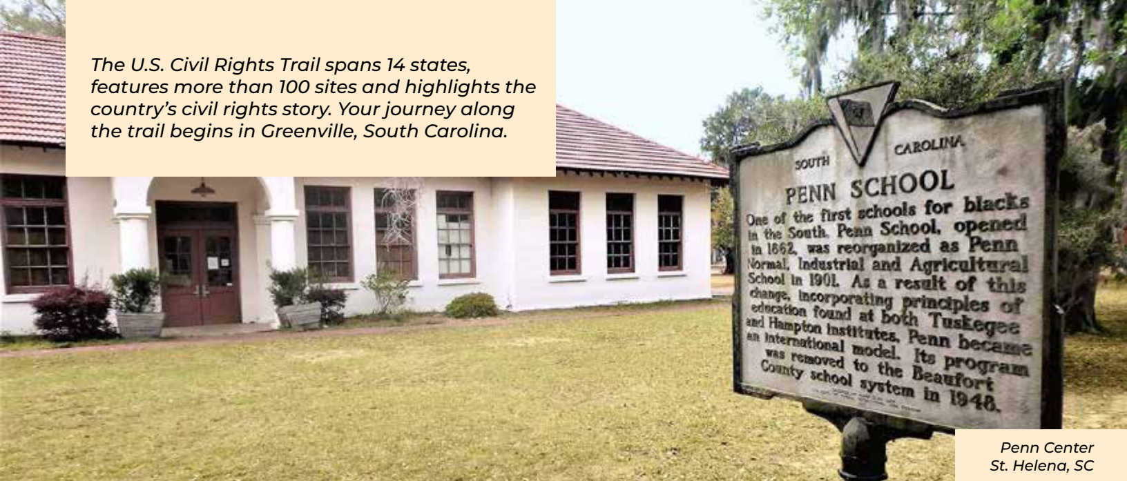
Penn Center St. Helena, SC

The U.S. Civil Rights Trail spans 14 states, features more than 100 sites and highlights the country's civil rights story. Your journey along the trail begins in Greenville, South Carolina.