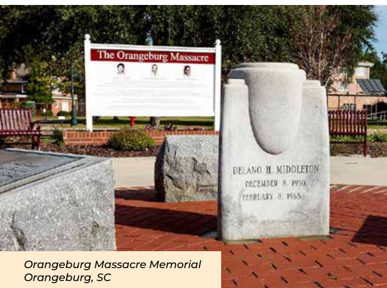
Orangeburg Massacre Memorial Orangeburg, SC

In 1960, students in Orangeburg organized a sit-in at S.H. Kress & Co., a department store with a lunch counter where Black and white patrons were not permitted to dine together. In 1968, tensions continued to rise in Orangeburg, leading to several incidents at the local All-Star Bowling Lane because the owner was not willing to desegregate. This led to the violent clash known as the Orangeburg Massacre on Feb. 8, 1968, wherein the South Carolina Highway Patrol fired guns into a crowd of 200 protestors gathered on South Carolina State University's campus, killing three students and injuring 27 people. A memorial placed on campus chronicles the massacre and memorializes the victims.