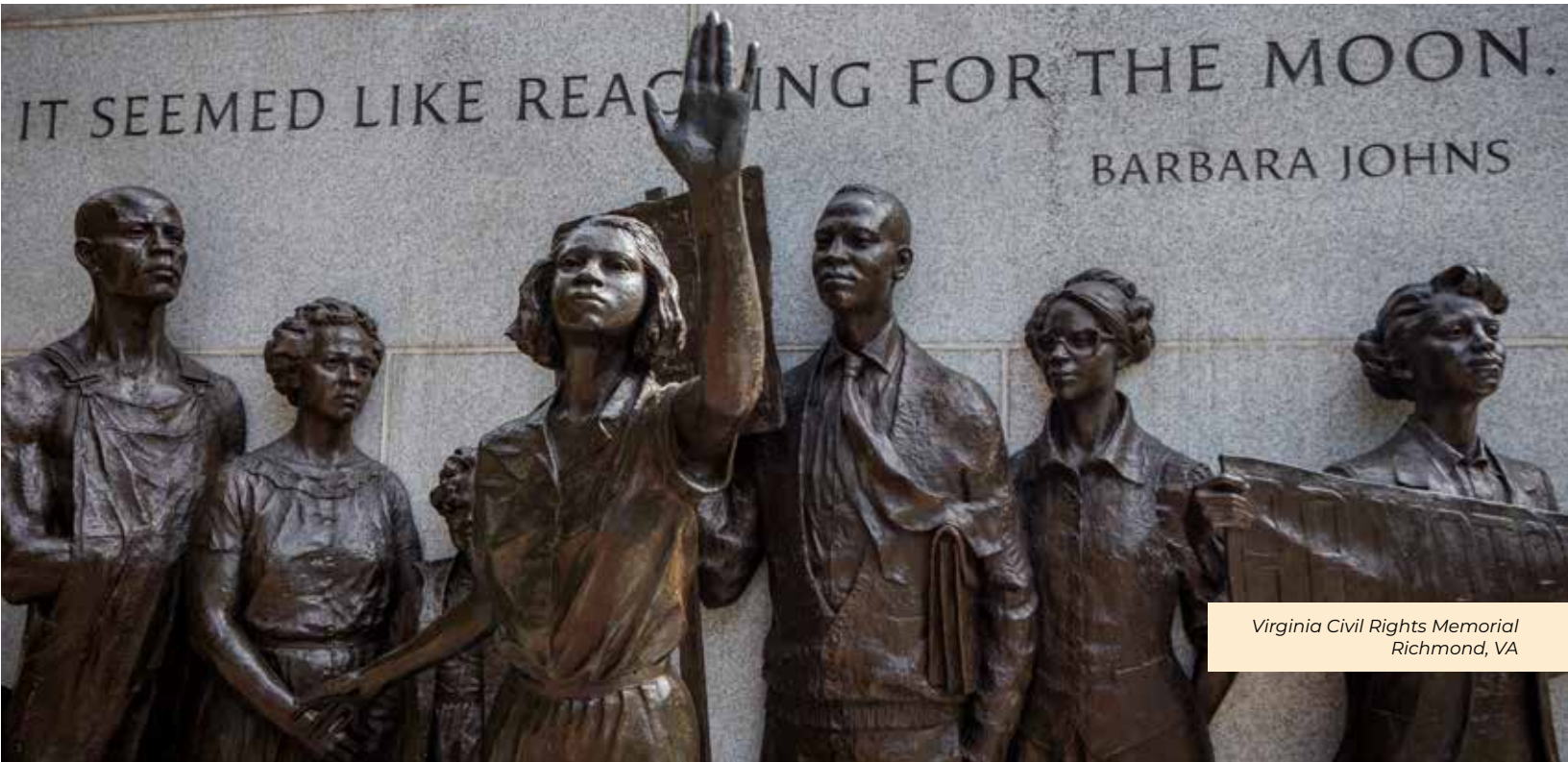
Virginia Civil Rights Memorial Richmond, VA