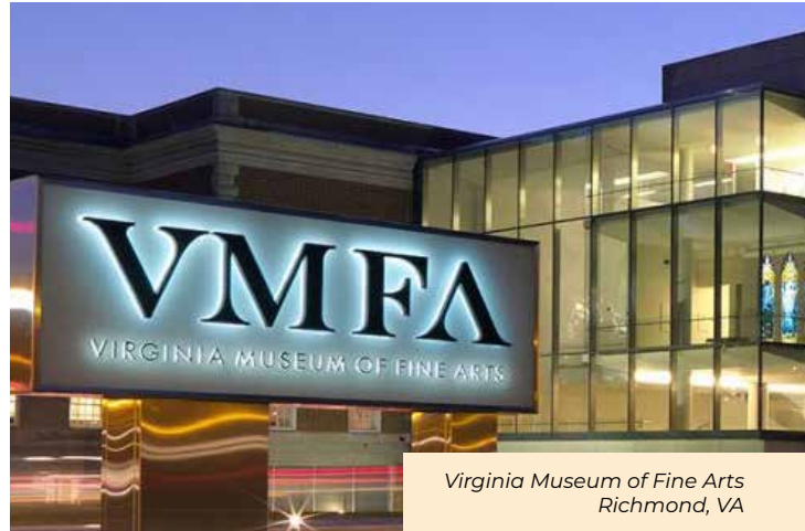
Virginia Museum of Fine Arts Richmond, VA