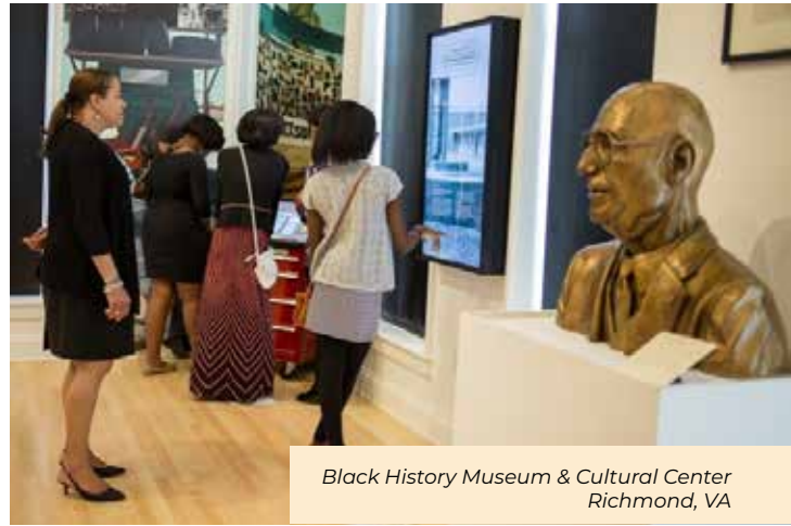
Black History Museum & Cultural Center Richmond, VA

The museum is open 365 days a year and its grounds are the permanent home of "Rumors of War," a 27-foot statue by artist Kehinde Wiley.