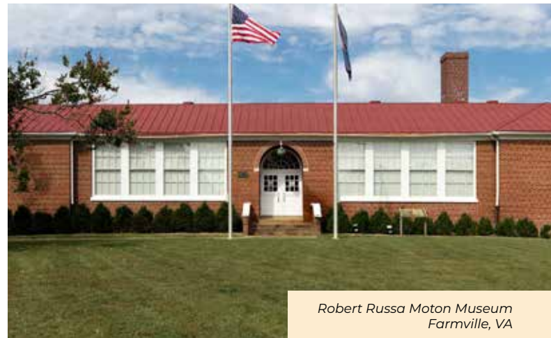
Robert Russa Moton Museum Farmville, VA

While the fight for desegregation was heating up in the late 1950s and early '60s, the country saw plenty of protests and counter protests, as well as walkouts, sit-ins and boycotts. But earlier than that, in 1951, one such event was especially powerful because it was led by two students: 16-year-old Barbara Johns and John Arthur Stokes. They rallied a group of students and organized a walkout of all-Black Robert Russa Moton High School in protest of the school's poor conditions. The NAACP then teamed up with the students and worked to integrate the schools of Prince Edward County. The lawsuit filed against the school board of Prince Edward County was later incorporated into Brown v. Board of Education , making Farmville a key destination to learn about school integration and the overturning of Plessy v. Ferguson .