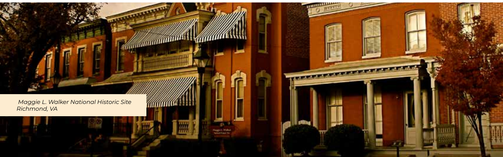
Maggie L. Walker National Historic Site Richmond, VA

This concludes your U.S. Civil Rights Trail journey in Virginia