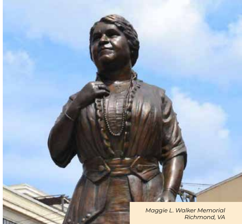
Maggie L. Walker Memorial Richmond, VA

On Feb. 20, 1960, Virginia Union University students entered Thalhimers Department Store and were refused service at the whites-only lunch counter. In protest, they stayed until the business closed for the day. They were ultimately arrested, but their convictions were overturned in 1963 – a momentous victory for the Civil Rights Movement.